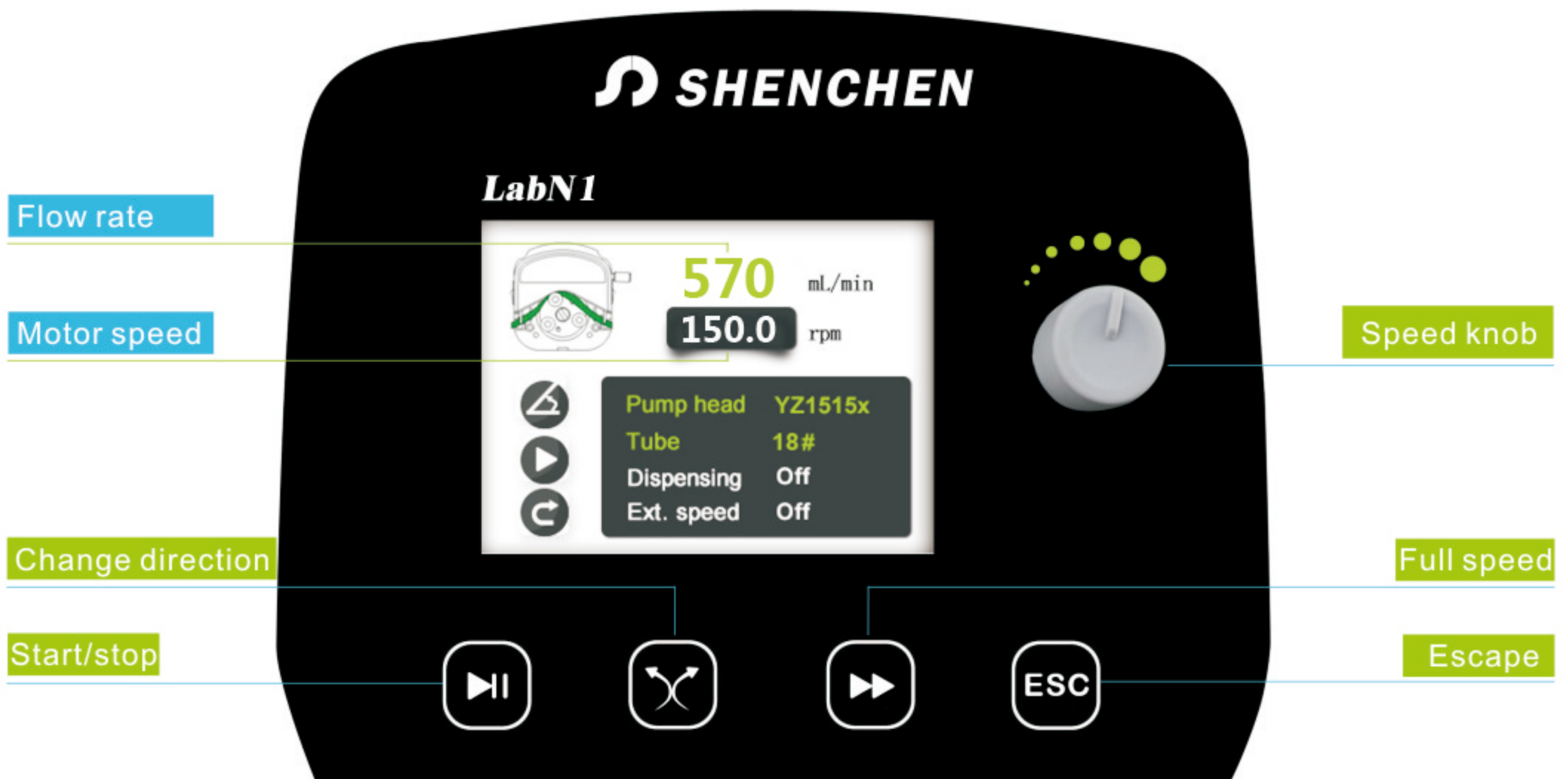
LabN Series Interface and Keypad