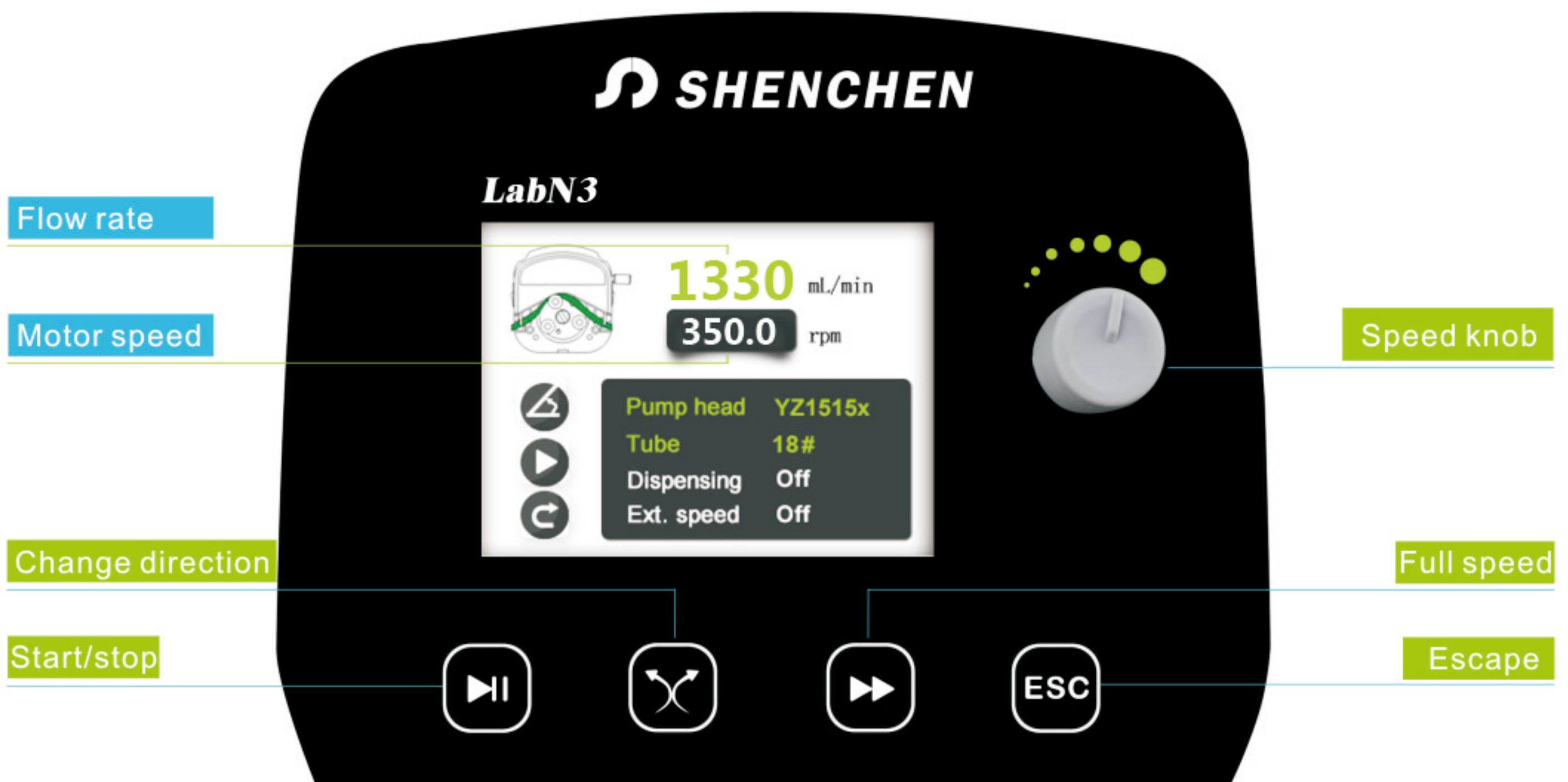
LabN Series Interface and Keypad