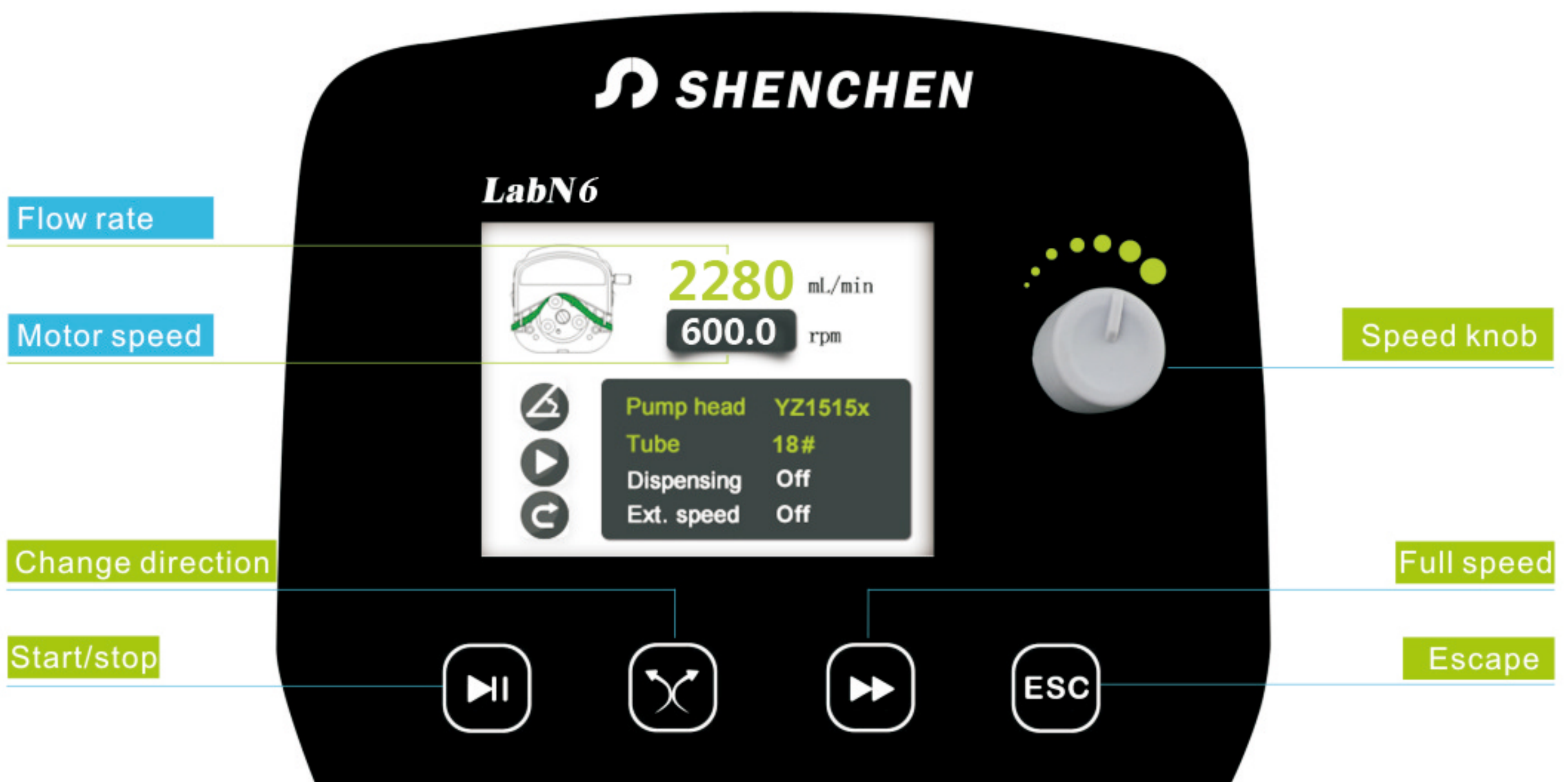
LabN Series Interface and Keypad